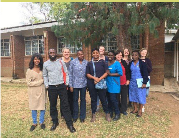
It takes a village to build surgical capacity so thousands of people, who simply would not otherwise have access to surgical care, can receive it. PFP partners and collaborators from MJC, the Red Cross War Memorial Children's Hospital in Capetown SA, Raising Malawi and the University of Oslo Hospital.