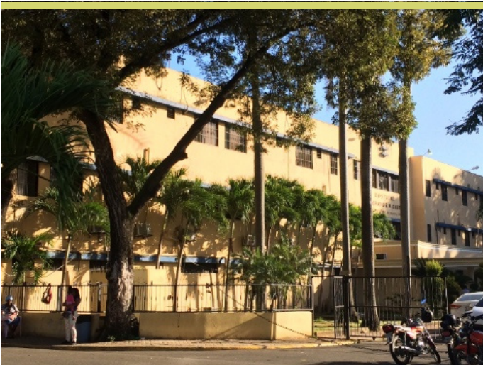
Outside view of Hospital Salvador B. Gautier, a public hospital and one of the main teaching hospitals in the country - located in Santo Domingo, Dominican Republic.